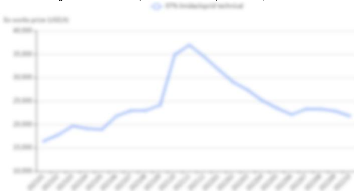
Figure 2.2.1-1 Ex-works price of 97% imidacloprid technical, Jan. 2021–Oct. 2022