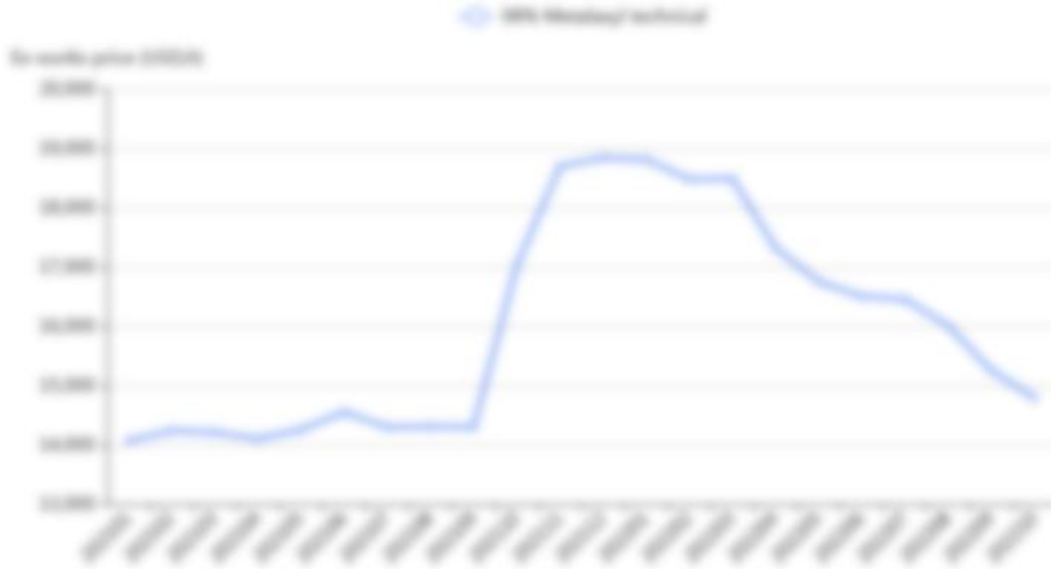
Figure 2.3.4-1 Ex-works price of 98% metalaxyl technical, Jan. 2021–Oct. 2022