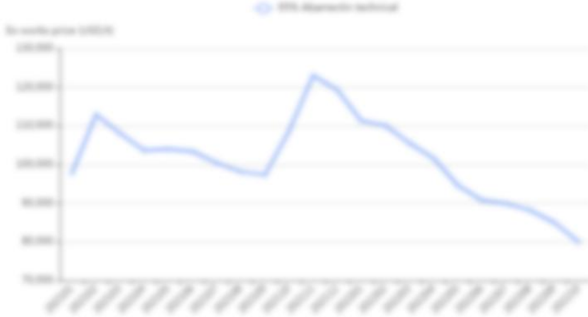
Figure 2.2.4-1 Ex-works price of 95% abamectin technical, Jan. 2021–Oct. 2022