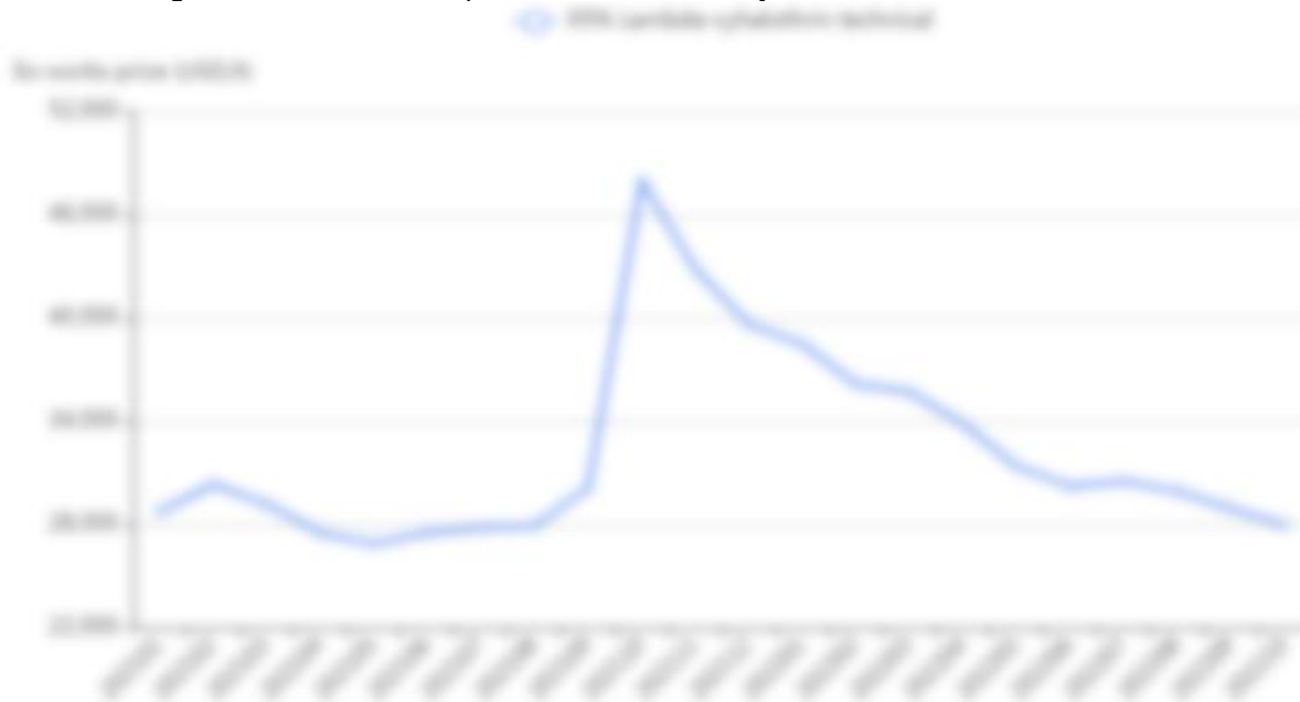
Figure 2.2.3-1 Ex-works price of 95% lambda-cyhalothrin technical, Jan. 2021–Oct. 2022

occurred on X Sept, which has put all its production operation into suspension, including lines for XX,XXX t/a tert-Butanol, a core raw material of lambda-cyhalothrin. It is expected that the falls in price may stop or at least slow down in the following months.