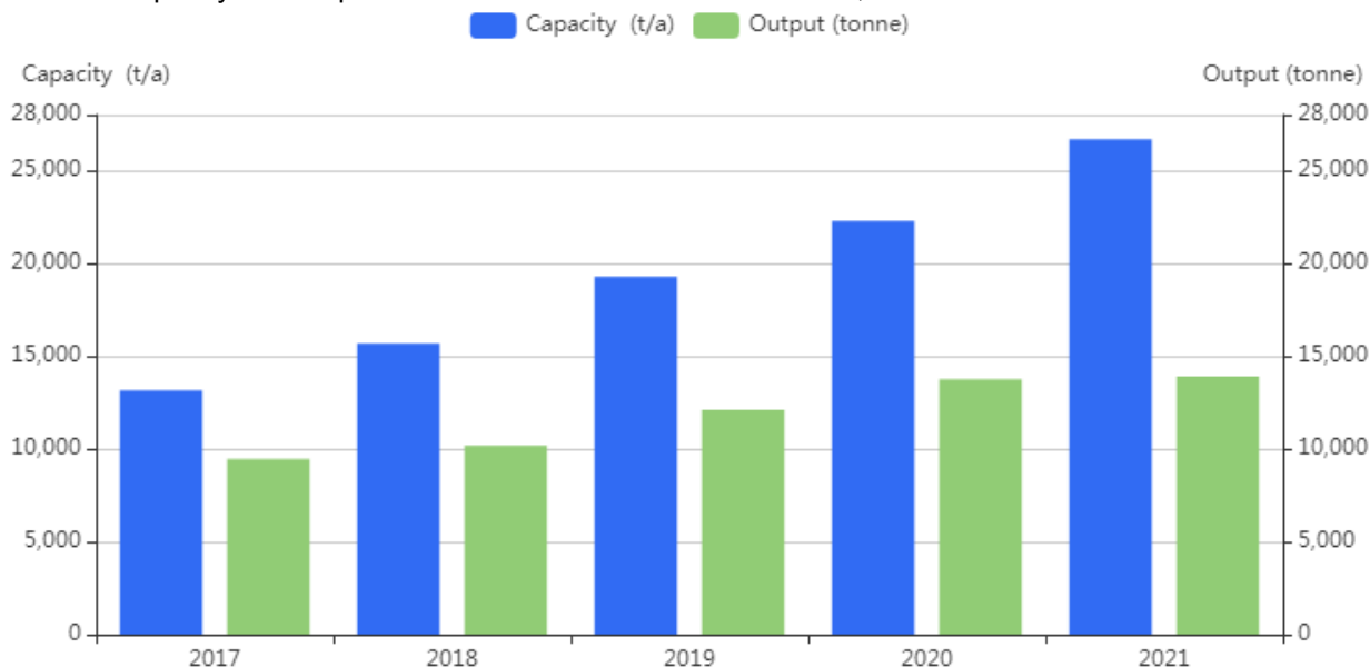
Figure 2.1-1 Capacity and output of 90% clethodim technical in China, 2017–2021

On the whole, the production capacity and output of clethodim technical in China maintained an uptrend from 2017 to 2021. The capacity increased from 13,140 t/a in 2017 to 26,680 t/a in 2021, with a CAGR of 15.22%, while the output increased from 9,450 tonnes in 2017 to 13,900 tonnes in 2021, with a CAGR of 8.02%.